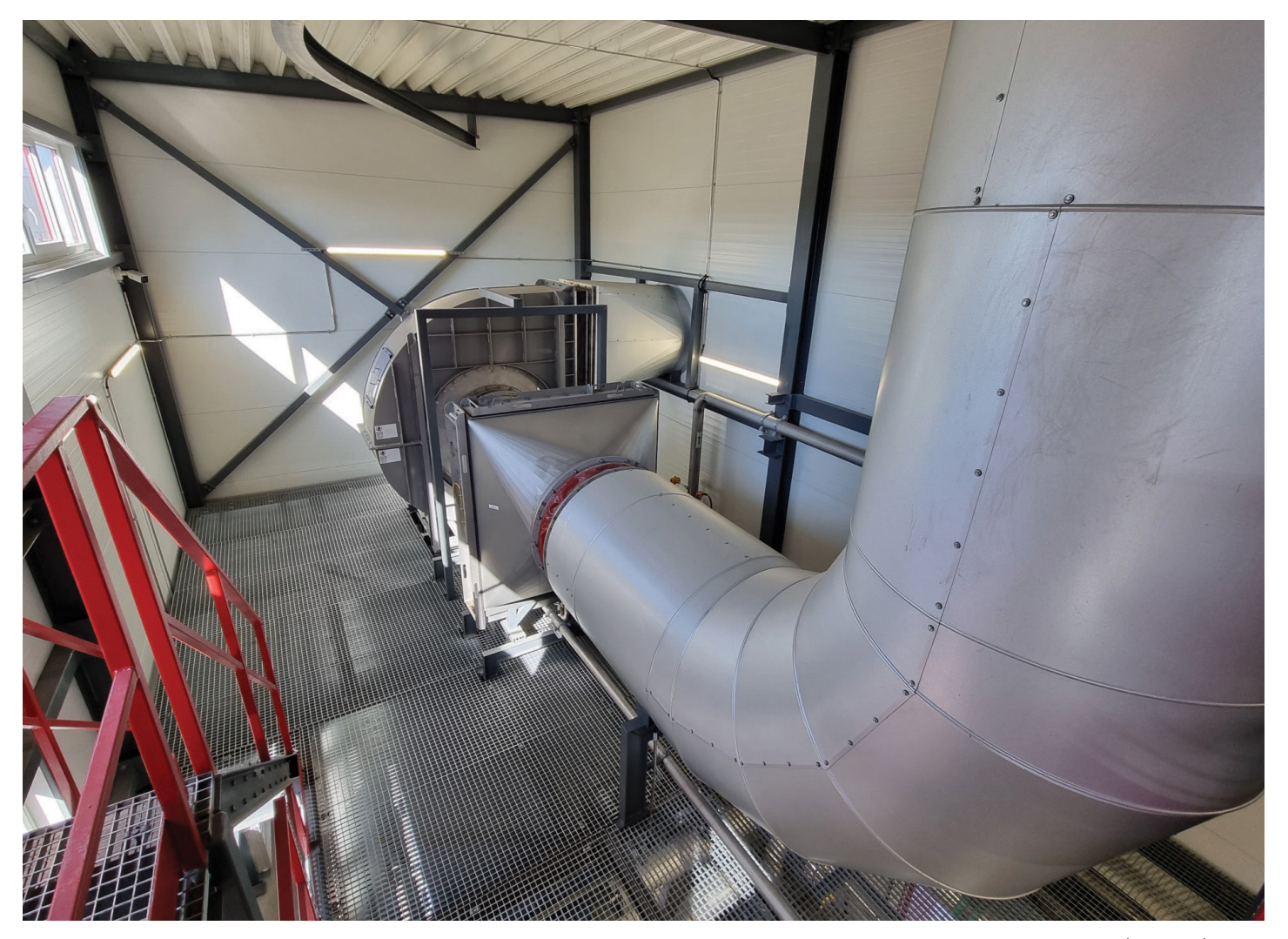
Kłajpeda | Litwa | 2022