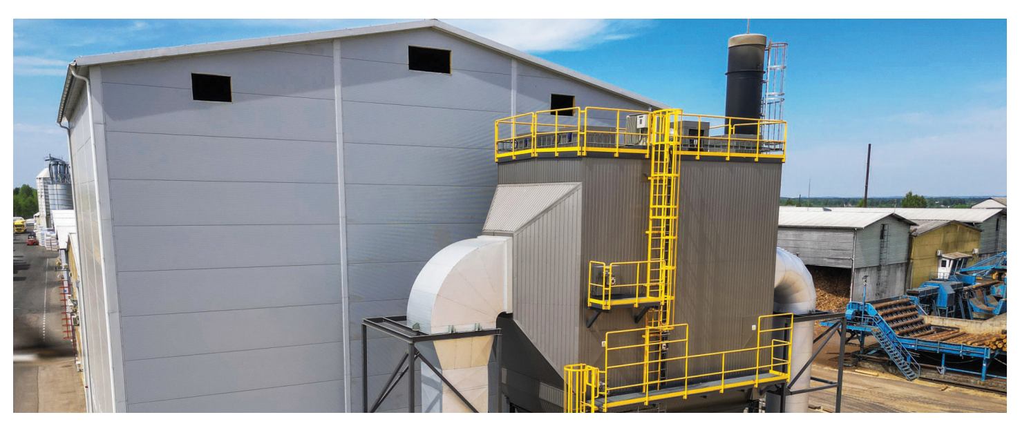
Jekabpils | Latvia | 2023