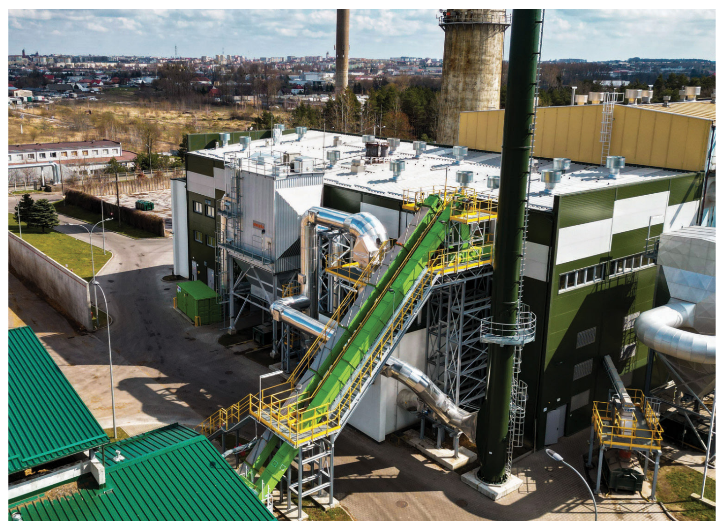
Llomza | Poland | 2023